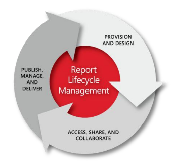
Obtain full support of the report lifecycle.

Microsoft® SQL Server® 2012 Reporting Services is a comprehensive, highly scalable solution that enhances real-time decision-making across the enterprise by enabling the creation, management, and delivery reports for pixel-perfect printing, interactive web viewing, and ad hoc data exploration. Microsoft enhances agility and offers greater choice by extending reporting into the cloud, allowing customers to take advantage of the cloud's accessibility and elasticity.